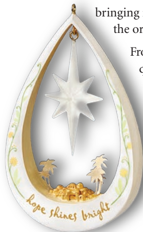
Hope Shines Bright, $12.50