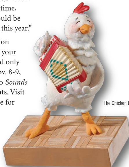
The Chicken Dance - $15.00