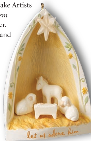
Let Us Adore Him - $15.00