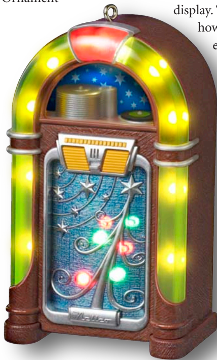
Swingin' Into Christmas - $28.00

Push a button, and the Swingin' Into Christmas jukebox plays four Christmas classics: "Deck the Halls," "Up On the Housetop," "It's the Most Wonderful Time