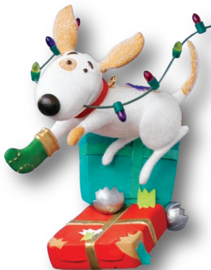
Bad to the Bone - $15.00