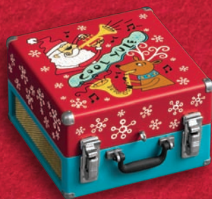
Cool Yule Record Player - $28.00

Take home both—and see the entire 2008 collection—while supplies last at Ornament Debut, October 11-12, at your Hallmark Gold Crown store. Don't forget your 2008 KOC membership card.