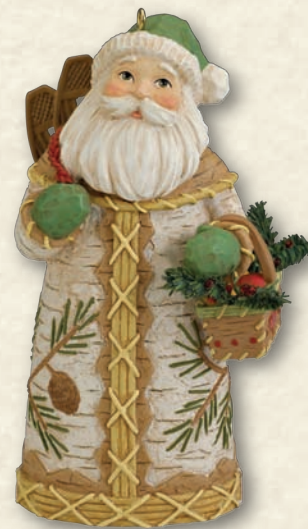
Canada -- Santas From Around the World - $15.00

Get both ornaments while supplies last during Holiday Open House weekend at your local Hallmark Gold Crown store. And be sure to check out lots of other weekend-only special offers. As always, bring your 2008 KOC membership card.