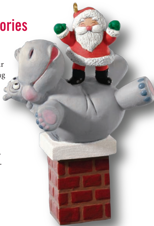
I Want a Hippopotamus for Christmas - $15.00

The Sounds of the Season collection will be available in November at your Hallmark Gold Crown store. And only during Holiday Open House, Nov. 8-9, save $5.00 when you buy any two Sounds of the Season Keepsake Ornaments. Visit your Hallmark Gold Crown store for more details.