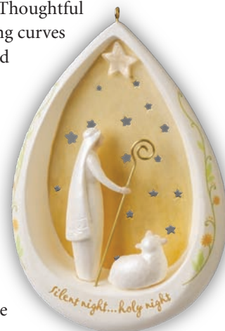
Silent Night, Holy Night - $12.50

From the star of hope shining above a quiet little town to the Baby Jesus resting in His mother's arms. . . share the story of Christmas with the Light of Bethlehem collection.