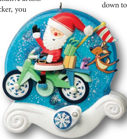
Wheely, Wheely Fun