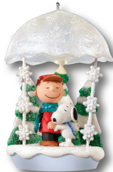
Christmas Hugs PEANUTS © United Feature Syndicate, Inc.

You guessed it. The second Club-exclusive ornament will be available for purchase beginning August 25. Christmas Hugs ($20.00), the endearing PEANUTS® ornament, highlights a much-loved duo,