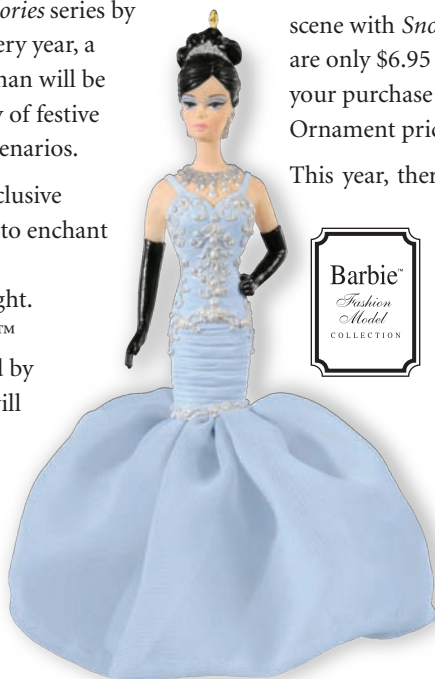
The Soirée™ Barbie™ Ornament