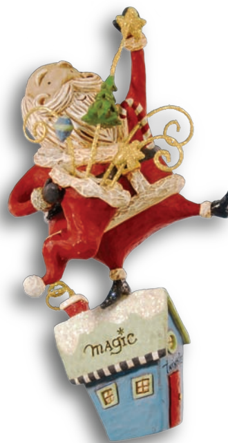
Clockwise from the top: Peace on Earth , A Jolly Ho Ho Ho , Magic Man , Ringin' in the Season , Twinkle Claus , and The Spirit of Giving