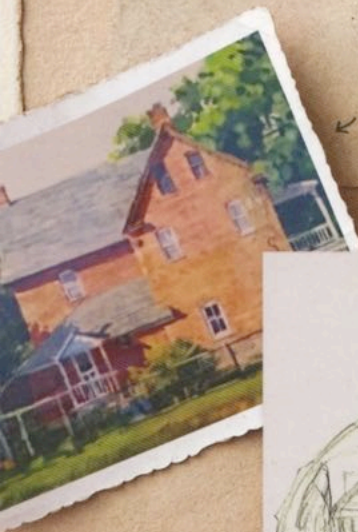
Uncle Marvin's home