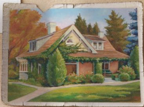
Painting I did of my grandparent's home