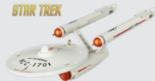
I.S.S. Enterprise™ STAR TREK™ QMP4104