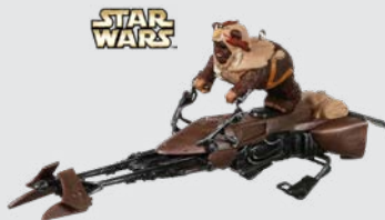
A Wild Ride on Endor™ Star Wars™: Return of the Jedi™ QMP4103