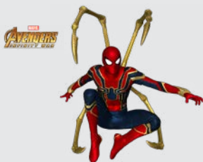
Iron Spider QMP4106