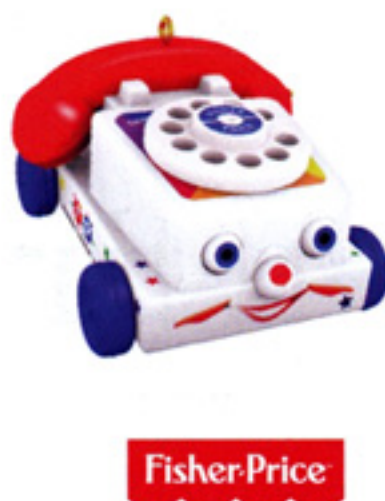
Tiny Chatter Telephone