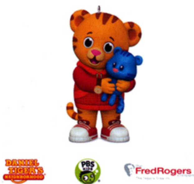
Daniel and Tigey Daniel Tiger's Neighborhood®