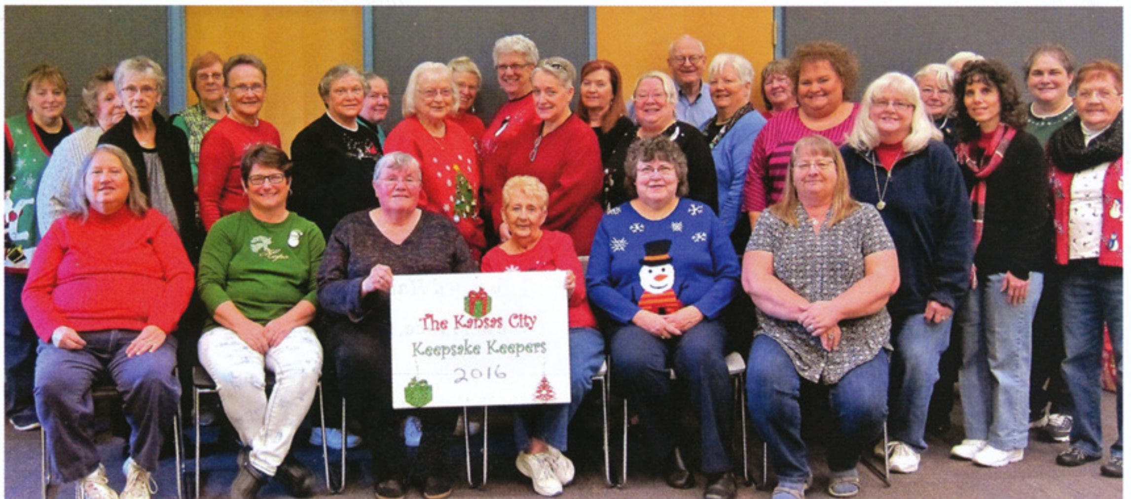
Members of the Keepsake Keepers gather for their annual December party, complete with a gift exchange.