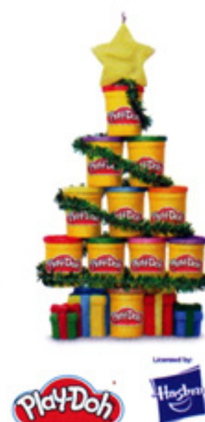
O Play-Doh® Tree Hasbro®

► More about these ornaments | KeepsakeCommunity.Hallmark.com