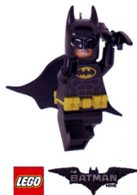
LEGO® BATMAN™ THE LEGO® BATMAN™ MOVIE