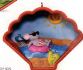
June 6th and final in series