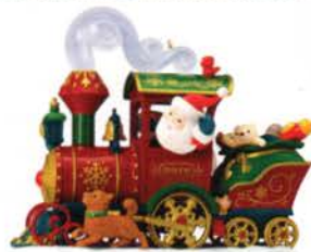
Santa's Christmas Train

If you haven't ordered your extra exclusives yet, there's still time. Order online now at Hallmark.com/KeepsakeOrnamentClub . U.S. only.