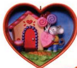
January 1st in series

ONE OF OUR MOST BELOVED SERIES, Cookie Cutter Christmas, has inspired a new six-month series. Look for a new ornament release each month from January through June both at Hallmark Gold Crown stores and online. The cookie cutters will each be shaped to represent a monthly holiday or event and are perfect for gifts or collecting. See all six at Hallmark.com/CookieCutterSeries .