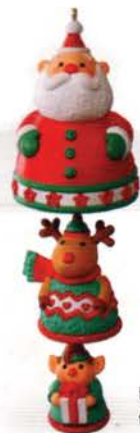
Dangle All the Way