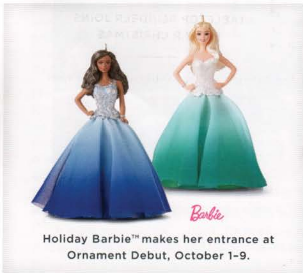
Holiday Barbie™ makes her entrance at Ornament Debut, October 1-9.