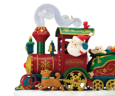
Santa's Christmas Train $39.95

You may also purchase any of these Extra Exclusive Ornaments at the additional costs listed below (limit one of each ornament per membership).