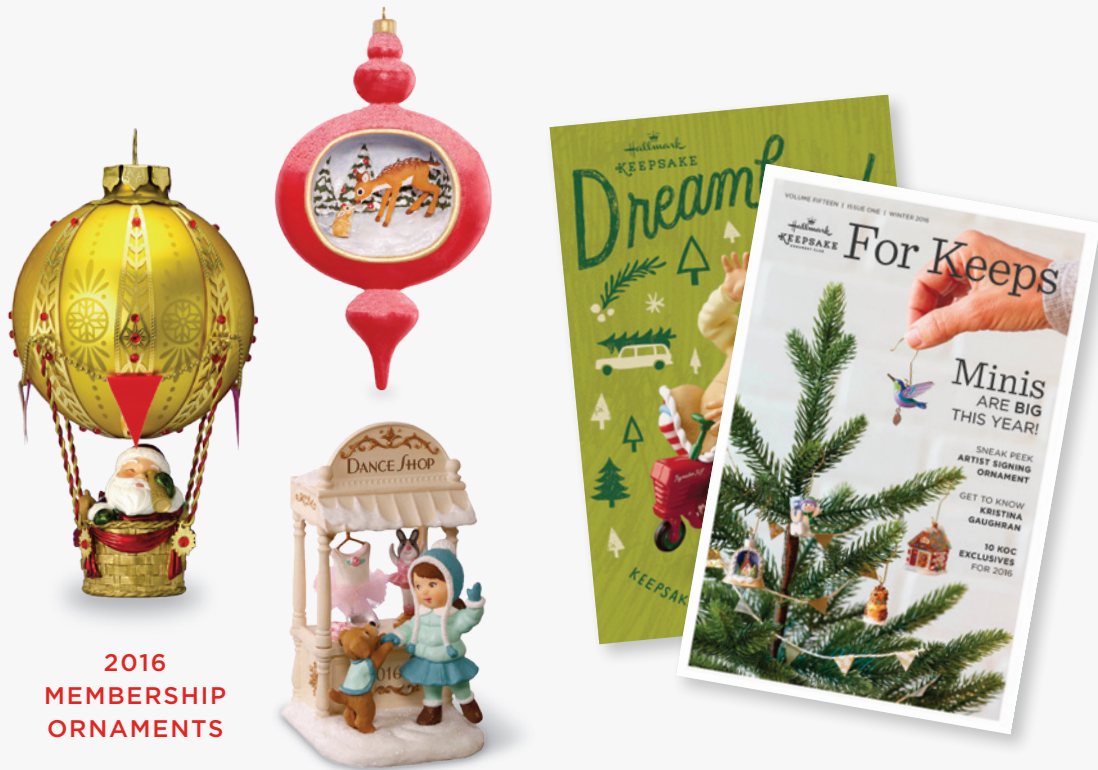
2016 MEMBERSHIP ORNAMENTS