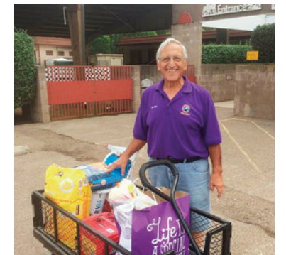
TOP: Annual pre-Ornament Premiere celebration.