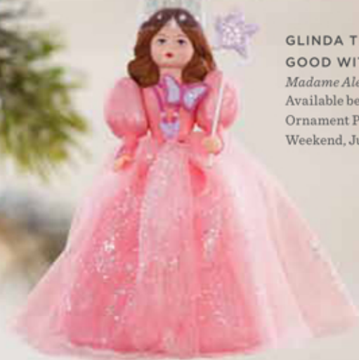
GLINDA THE GOOD WITCH™ Madame Alexander Available beginning Ornament Premiere Weekend, July 11-12