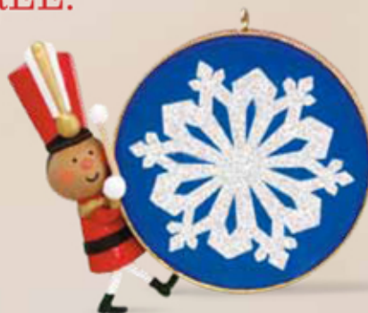
TIPPETY-TAP TOY SOLDIER 2015 Thank You Gift

This year you'll receive your FREE ornament at Debut...no more waiting! Just purchase a Hallmark Keepsake Ornament during Ornament Premiere weekend, and we'll mail you a coupon for a FREE Tippet-Tap Toy Soldier you can pick up when you purchase a Keepsake Ornament during Ornament Debut weekend, October 3-4. (US Only)