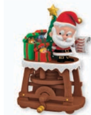
Hide 'n' Peek 4½" h.

With your 2011 Keepsake Ornament Club membership of $30.95,* you can choose two of the three Club membership ornaments shown below. Want all three? Just send an additional $22.00.* Check the boxes of the ornaments you want (limit one of each design per membership). If you don't choose which ones you want, we'll choose your ornaments for you.