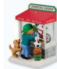
Christmas Window 2011 4" h.