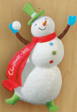
LET IT SNOW

Shoppers can get a free Keepsake Ornament in November if they purchase an ornament in July and October.