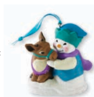
Snow Buddies Repaint of 2011 series ornament. 2½" h.

Ship separately from membership ornaments.