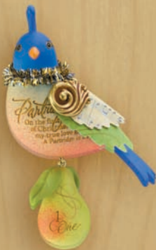
PARTRIDGE IN A PEAR TREE