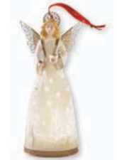
Starlight Angel 5½" h.