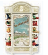
Santa's Armoire Repaint of 2010 in-store signing ornament. 5¼" h.