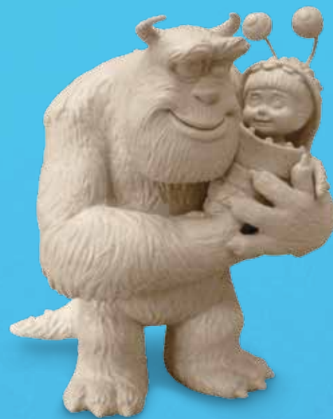
Here's a look at work in progress on the 2012 ornament for the Disney/Pixar Legends series—Sulley and Boo from Monsters, Inc.

"Parents and young kids really like our ornaments from Toy Story and Cars , and those aren't going away," he says. "This series will give us a wider range of Pixar memories to hang on the tree."