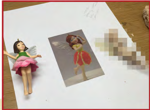
Three years of fairies are displayed here. Bet you wish that 2017 sculpt wasn't pixelated. But we can't wait to add 2016's tulip fairy to our collection.