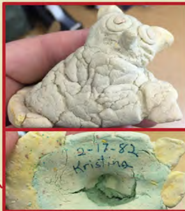
A VERY early sculpture by the future Hallmark Keepsake Ornament Artist.