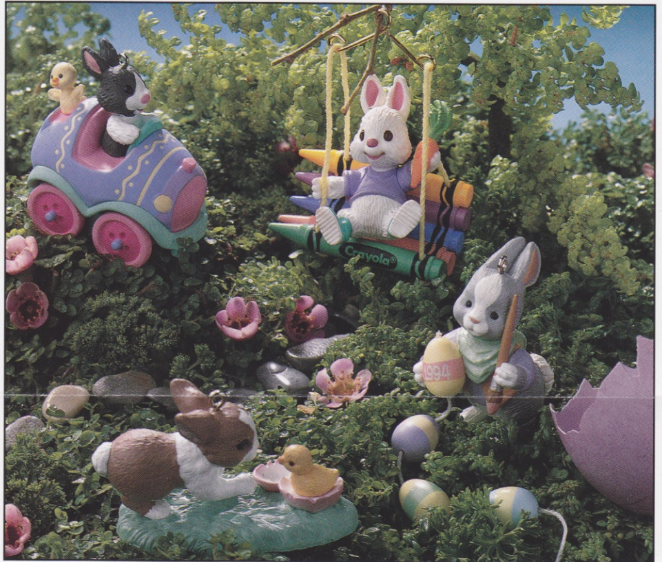
Since 1991, Keepsake Easter Ornaments have become a new tradition, celebrating the joys of spring. Pictured here are some of the newest treats for 1994: "Here Comes Easter," "Colorful Spring," "Peeping Out" and "Easter Art Show."

A new tradition since 1991 is the Keepsake Easter Ornament collection. These delightful