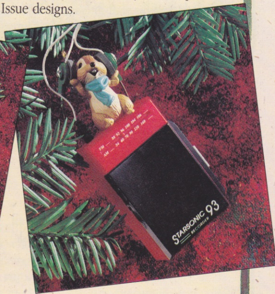
"Messages of Christmas"