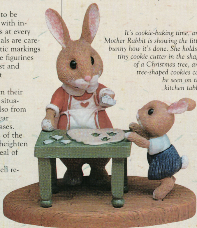
It's cookie-baking time, and Mother Rabbit is showing the little bunny how it's done. She holds a tiny cookie cutter in the shape of a Christmas tree, and tree-shaped cookies can be seen on the kitchen table.

Each "Tender Touches" figurine comes with its own Hallmark Collections gift box. An enclosure card provides information about the line and its designer, enabling collectors to share the story behind these appealing new collectibles with their family and friends.