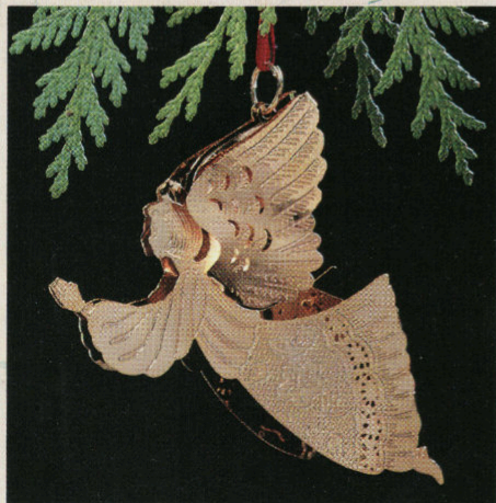
"Festive Angel" is crafted of delicately etched, dimensional brass.

Some of the earliest ornaments collected in this country were made out of shiny glass. Called kugels , these ornaments came from Germany. They were heavy blown-glass designs in ball and fruit shapes.