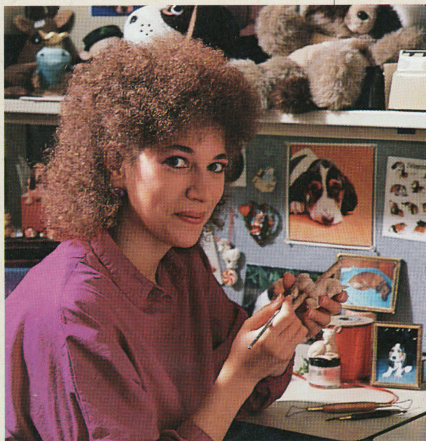
The artist at work on a favorite subject, the unicorn.

After all, sharing holiday fun is what Keepsake Ornaments are all about!