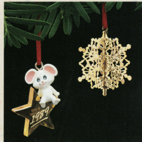
"Starlit Mouse" and "Brass Snowflake" brighten a miniature ornament collection.